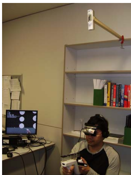
Figure 1. System setup.

A histogram which depicts the distribution of the system's positional differences as compared with the Polhemus Patriot tracker's readings is shown in fig. 2. The histogram in fig. 3 in turn shows the distribution of orientation errors. These histograms give an overall depiction of the frequency at which differences between the expected values and the estimated values occurred. It can be seen from the figure that the majority of the differences in position are mainly concentrated between -0.5 and 0.5 cm. Differences in rotation, depicted in fig. 2, are more spread out and are generally within -1 and 1 degrees.