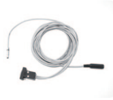
RS232, DB9 power